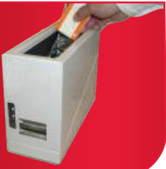
On-site ticketing at the place of need