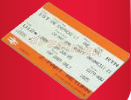
Tickets accepted at station barriers